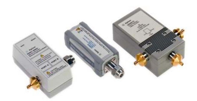
Figure 4: Calibration standards used for calibrating a NVNA, showing (left to right) a vector calibration standard (ECal module), USB power sensor, and phase reference which are used to analytically remove the systematic errors from the measurements.

While calibrating a nonlinear measurement system may seem like it could be a complicated process and procedure, calibration is actually guite simple and straightforward. The vector network analyzer requires a vector calibration standard such as an ECal module or mechanical calibration standards to remove the systematic errors associate with vector corrected measurements, a power meter or USB power sensor to calibrate the signal power levels incident on the device under test (DUT), and a phase reference to provide a cross-frequency phase reference for the harmonic signals. The NVNA provides a guided calibration sequence that prompts the user to connect the standards, and the firmware performs the appropriate measurements and to calculations provide calibrated nonlinear measurements that are traceable to NIST.