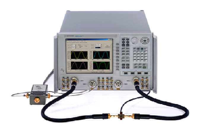
Figure 3 . Agilent's NVNA firmware, for use with the PNA-X network analyzer, establishes a new industry standard in RF/MW nonlinear network analysis from 10 MHz to 50 GHz. It allows the engineer to deterministically measure X-parameters.

To generate the X-parameters from a circuit-level schematic, first create the schematic in ADS. Once the schematic is complete, information regarding frequency, bias, temperature, and other important parameters is entered into the X-Parameter Generator. This tool takes the circuit-level design and computes the X-parameters for a component or module that can be used in an ADS, harmonic balance or circuit envelope simulation. The X-parameter Generator is very flexible and can generate X-parameter models of nonlinear, multiport components with multi-tone stimulus, as well as simulation under load-pull conditions.