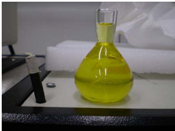
Fig. 1 Gay-lussac pycnometer with biodiesel.

The pycnometer used to measure density of biofuels is of gay-lussac type as depicted in figure 1.