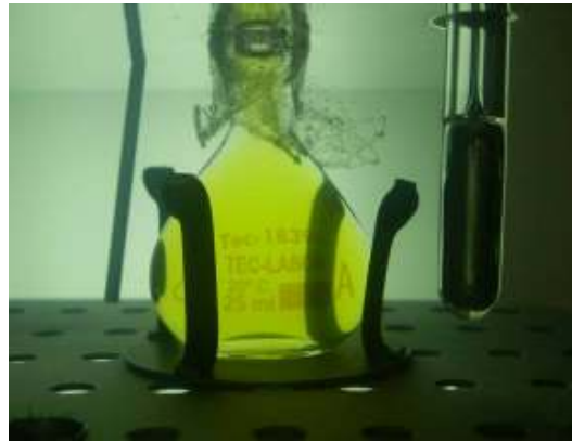
Fig. 3 Covered gay-lussac pycnometer with biodiesel in the thermostatic bath where temperature gradient is measured with a pt-100 thermometer.

Figure 3 shows how the temperature gradient is evaluated in this case. Thermometers are positioned around the pycnometer as the flask is sealed by the PVC foil. This does not need to be done when stable fluids are being measured. Instead, a thermometer pt-100 is placed inside the pycnometer for stable fluids. This procedure is also required because pt-thermometers could not be properly cleaned after biofuel immersion.