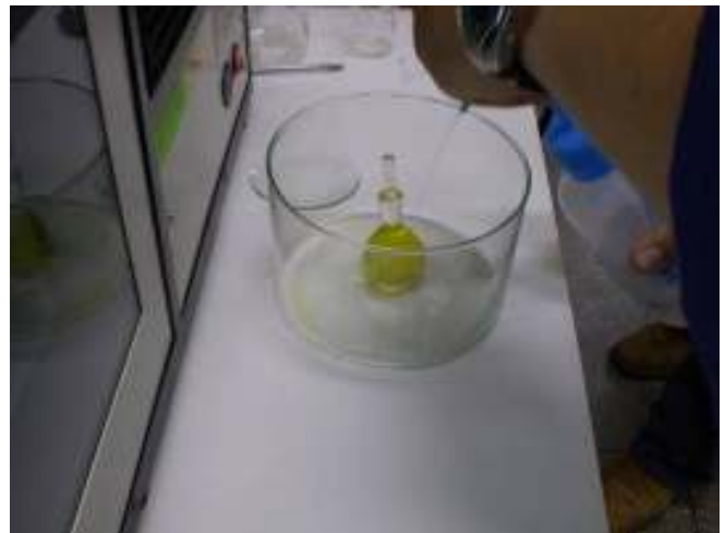
Fig. 4 Gay-lussac pycnometer filled with biodiesel being dried out faster with the aid of acetone.

When retrieving the pycnometer from the bath, the flask is sealed with its lid. The temperature drift inside the pycnometer is of 0.2 °C when it is removed from the bath. Then, acetone is sprayed on the pycnometer. The volume of the fluid is slightly reduced which can be noticed by looking at the pycnometer capillary. Figure 4 and figure 5 show those sequential steps.