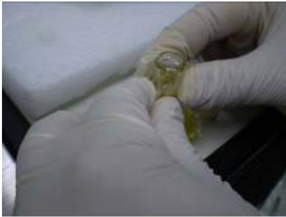
Fig. 2 The gay-lussac pycnometer is covered by a PVC foil when biodiesel density is to be determined.

The evaluation of the density values of biofuels requires a few extra precautions in order to guarantee reliable results. It is a well-known fact that biodiesel is susceptible to chemical modifications when exposed to oxygen and/or light [16] which in turn lead to density changes. Here we describe a simple and effective way to accomplish the characterization avoiding a significant density value alteration. Pycnometers are open glass containers as shown in figure 1. We have performed the biofuel density measurements with such appliances by covering the flask during the assay with a PVC or silicon foil as shown in figure 2.