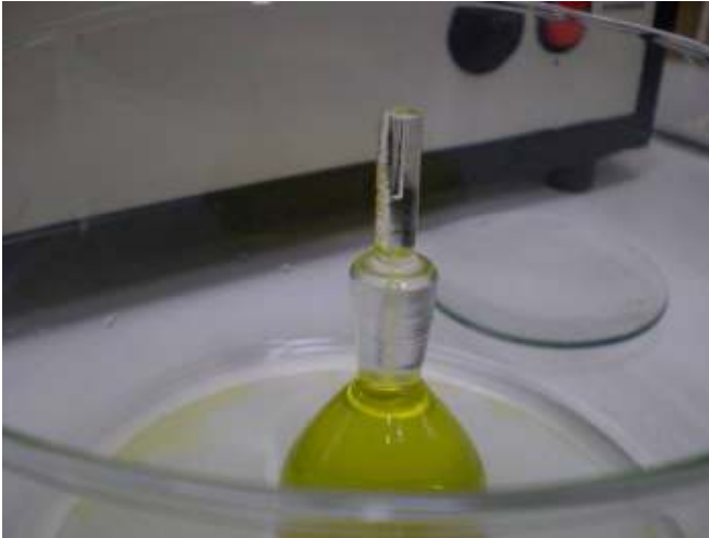
Fig. 5 Biodiesel volume reduction can be observed by looking at the pycnometer capillary.

The pycnometer is then dried and weighed as depicted in figure 6. This procedure is repeated at least seven times.